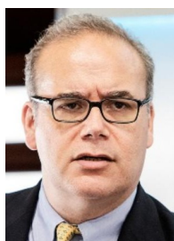
Máximo Torero FAO